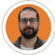
Francisco Pizarro Pontificia Universidad Católica de Valparaíso, Chile