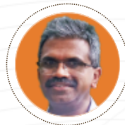
KJ Vinoy Indian Institute of Science, Bangalore, India