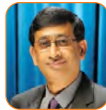
Goutam Chattopadhyay NASA JPL, USA