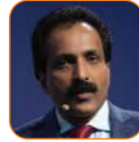
S. Somnath Secretary DoS & Chairman, ISRO