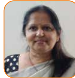
Suma Varughese DS & DG-Med, CoS & CS (MCC), DRDO